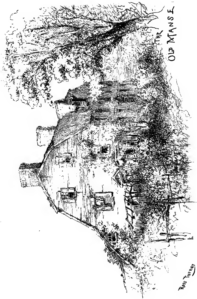
THE OLD MANSE